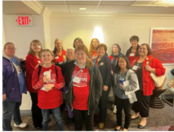
Figure 1 Part of the Nevada's Representation

And of course, there's Christmas and New Year's Day. Yes, lots of holidays – but still wish there was one during March or April.