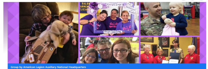
ALA Children & Youth

https://www.facebook.com/groups/ALACHildrenandYouth/